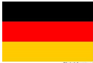
German National Flag