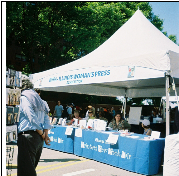
Photo shows IWPA participants at the 2006 PRBF.

Huge thanks to everyone who took the time to complete a PRBF surveys. The information you provided was essential to our planning effort!